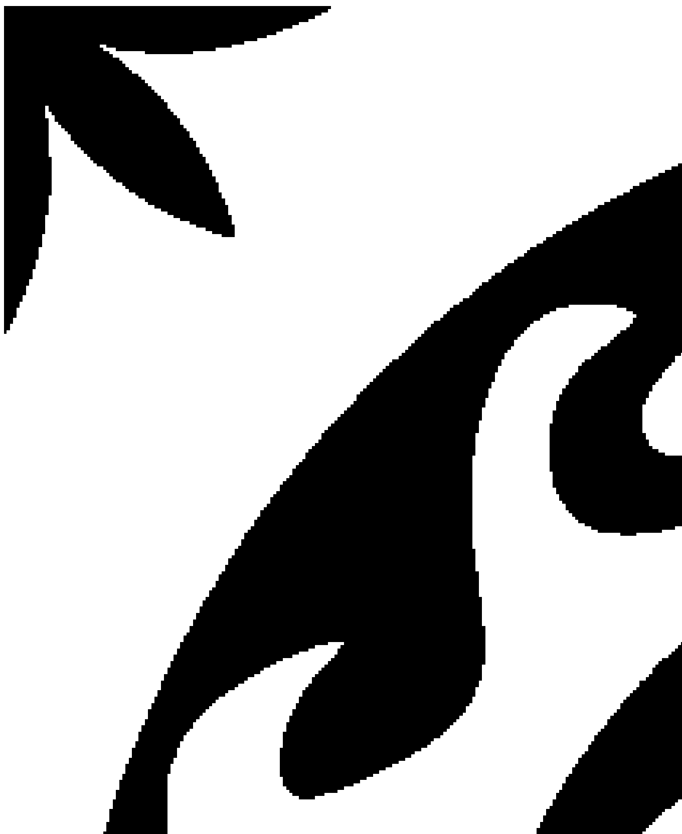
Pattern illustration 1:1